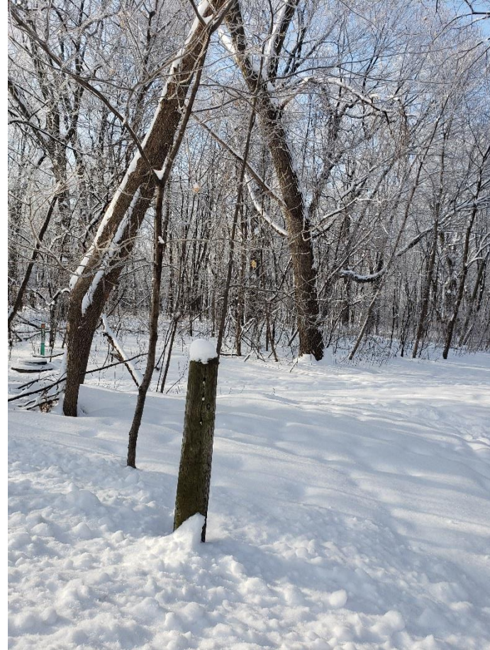
PROPOSED SITE OF 2-1/2 ACRE POLLUTED STORM WATER RUN OFF HOLDING AREA